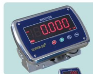
不锈钢仪表 Stainless steel housing indicator