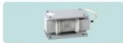
首创的管状组件，获得国家专利 Load cell part originated with us, National patent