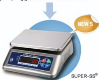
SUPER-SS® NEW 5

We produced more than 300,000 units in the past 10 years, bring great benefits to our clients.