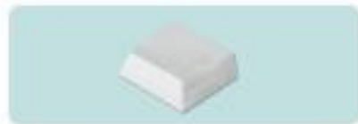
秤体材料验证—独特的塑包制材料 Cross section of platform material Original plastic covered steel material